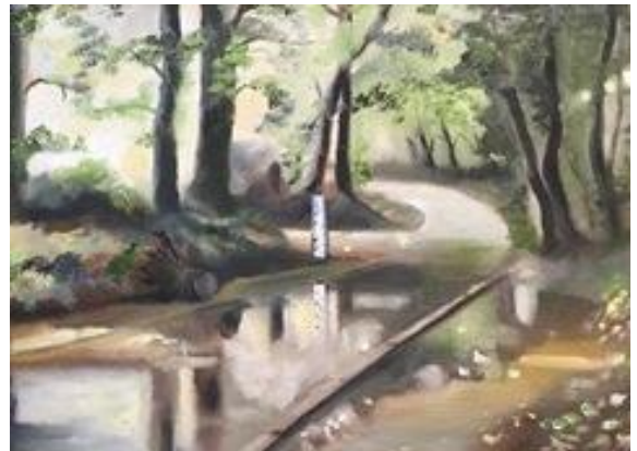
4. The Ford, Sporhams Lane