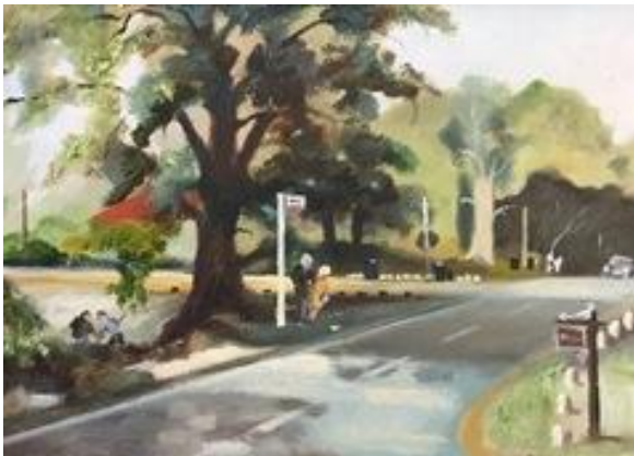
3. Waiting For The Bus, East Hanningfield Road