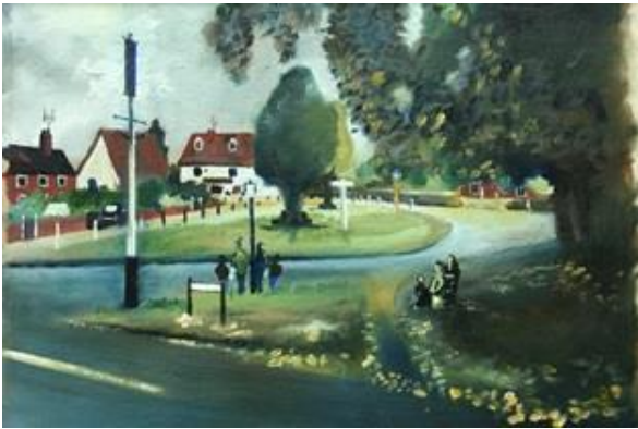
1. Sandon Village