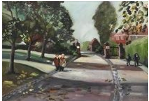
2. Alexander Mews