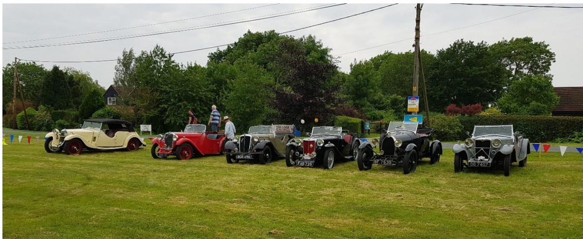
A selection of old cars.

What another lovely event in aid of Farleigh Hospice! A big “thank you” to the organisers and especially to the host gardeners for signing up to this special day. Some of the hosts have opened up their garden spaces for a good few years now. It was obvious how much care and preparation has gone into getting everything ready for this year’s event.