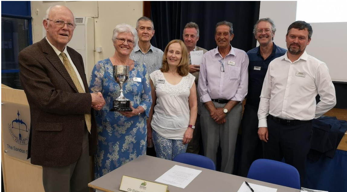
Photo of Sandon Cup Presentation with all the Councillors