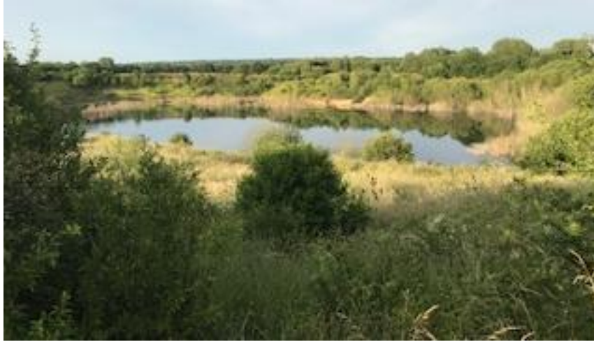
The Northern void

The Quarry is run by Bretts and lies next to the A12, with the houses on Mayes Lane running along the other side. There are two voids (Southern and Northern) where gravel and sand has been extracted. The Southern void is currently being filled with inert waste, mainly from the many building sites around Chelmsford. This currently receives up to 100 lorries a day. The Northern void is at present full of water that they keep to a reasonable level by pumping it into Sandon Brook. The entrance is from the A1114 near Great Baddow.