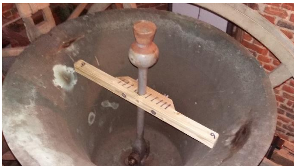
Clapper 'tied' so the bell can't sound

We are finally back in the tower and able to ring! However, the ropes are too close to comply with social distancing guidelines, so we are practicing on a single bell with the clapper tied so it doesn't sound outside the tower. We have a training simulator that runs a programme called Virtual Belfry. This enables us to ring one bell with five simulated virtual ringers projected on a wall. It's not very social but it is great for getting back in practice and making good use of the time until we can hopefully get all six bells ringing again from 21 June.