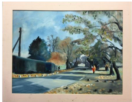
East Hanningfield Road